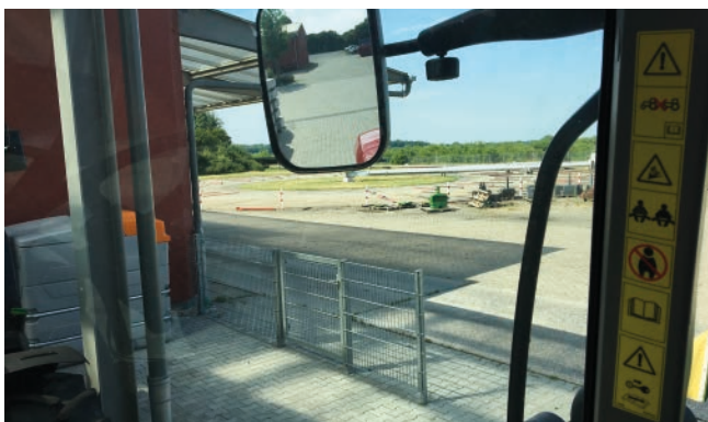
Direct view to the left

If a distance of 3.5 m between the front end of the mounted equipment and the centre of the steering wheel is exceeded, measures must be taken to compensate the resulting restriction of the field of view (Data Sheet for Mounted Implements – Federal Transport Gazette of 27/11/2009). As a result, an accompanying person is required as a signaller. This practice endangers the signaller and can hardly be realised during daily work in agriculture. Technical measures in the form of suitable visual support for the driver can provide relief in this case.