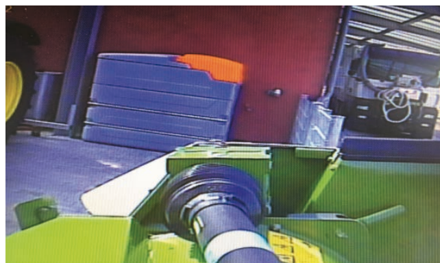
Indirect view to the left via the monitor with a camera mounted at the front